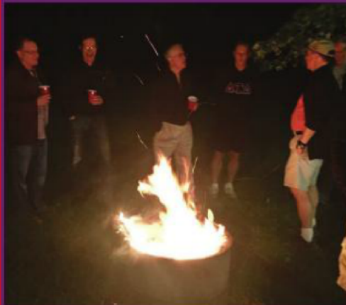
Alumni enjoy a campfire in the backyard during Homecoming.