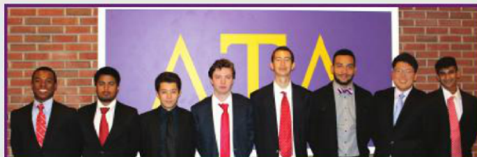
Beta Omicron welcomes eight new members this fall.